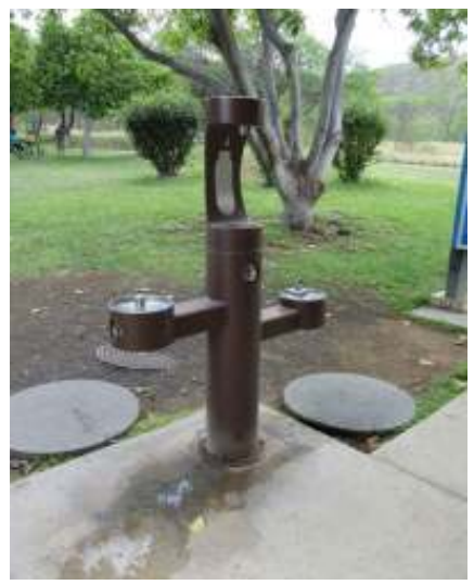
Hawai'i Tourism Authority.