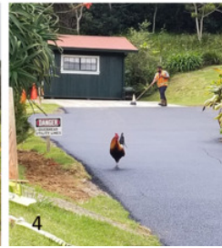
Hui o Laka's office during paving. It was an adventure for staff.