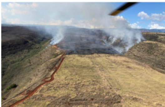
Photos from the June 16-18 wild fire that burned 2,100 acres below the junction of Kōke'e Road and Waimea Canyon Drive. Both roads were closed on the 17th. Left: orange and red lehua in bloom.